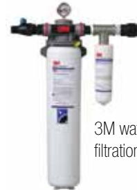
3M water filtration system