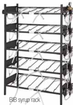
BIB syrup rack