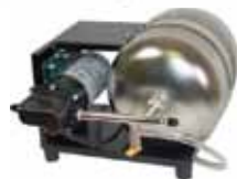
Econo water booster