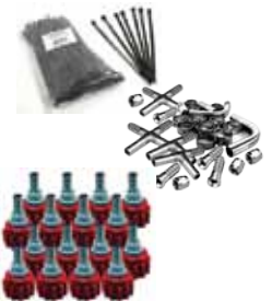
Fittings and connectors