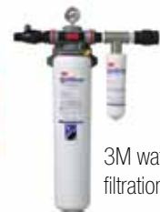
3M water filtration system