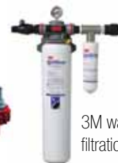
3M water filtration system