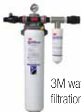
3M water filtration system