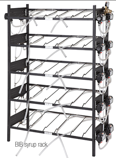
BIB syrup rack