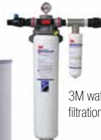
3M water filtration system