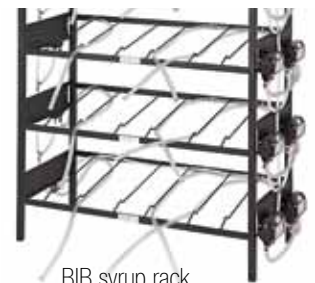
BIB syrup rack