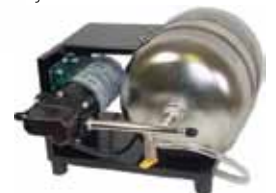
Econo water booster