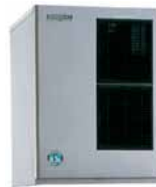
Ice maker and adapter