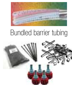
Bundled barrier tubing