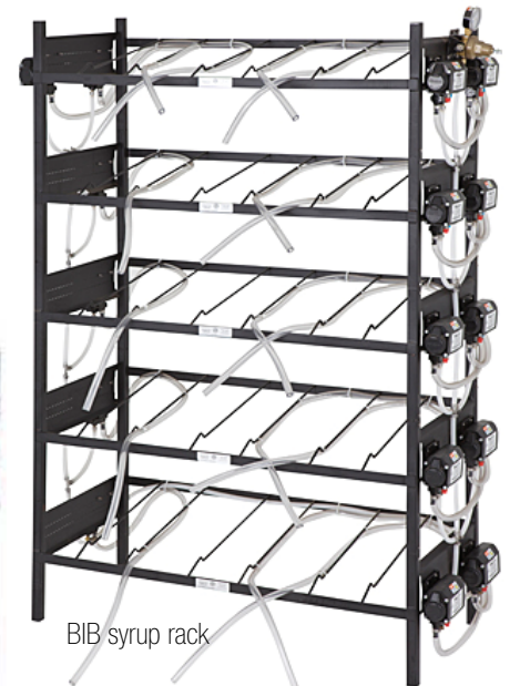
BIB syrup rack