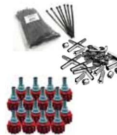
Fittings and connectors