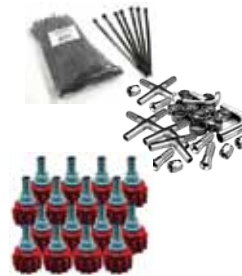
Fittings and connectors