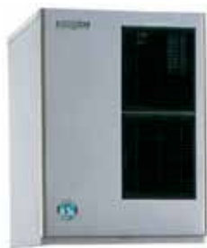
Ice maker and adapter